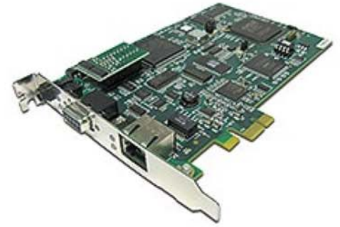
Brad® applicom™ Ethernet NIC

Design tools for custom solutions such as a gateway feature, time table management, alarming, etc.