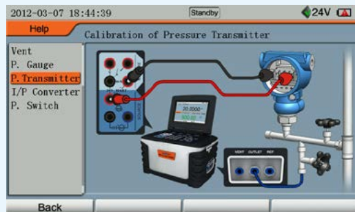
Built-in User's Manual