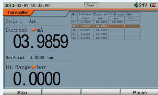
Pressure gauge / transmitter / switch calibration