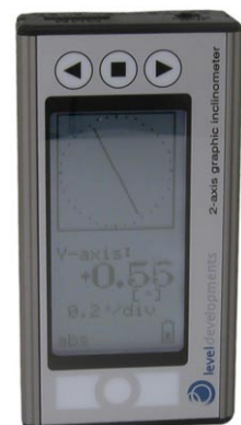
Vertical Edge - Y axis mode