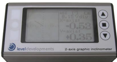
Bottom Face - 2 axis mode

The LD-2M will switch mode automatically depending on which face it is placed. The range of measurement is ±30° in each mode.