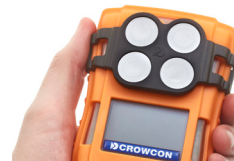
External filter plate Clip-on filter for dusty environments