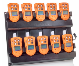
10 way charger For charging and storing your T4 fleet *Not available for UL certified products