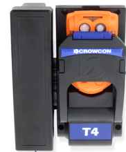
Vehicle charger Effective charging and storage whilst travelling