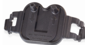
Aspirator plate Sample atmosphere prior to entry