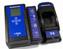
I-Test Easy automated bump testing and calibration solution