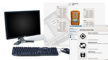
NEW Portables Pro 2.0 Software For easy configuration and servicing