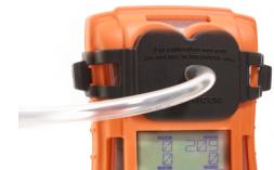
Bump/calibration plate To apply test gas to T4