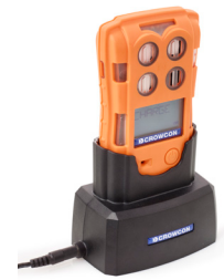
Cradle charger Docking station for easy charging