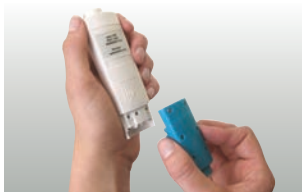
Easy exchange of probes with testo 206-pH1/-pH2/-pH3