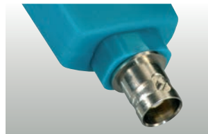
testo 206-pH3: pH3 probe head with BNC interface