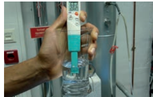
Ideally suitable for monitoring heating system water according to VDI 2035.