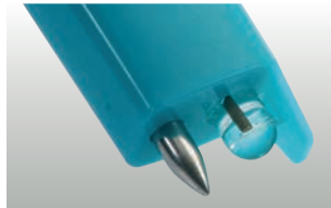
testo 206-pH1: pH1 probe head for liquids